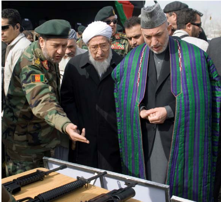
(US Department of Defense)

Karzai also blamed Afghan corruption on the misadministration of the billions of dollars of international aid by foreign donors: “If we can stop this kind of corruption, God willing, our administration will soon become free from corruption.”